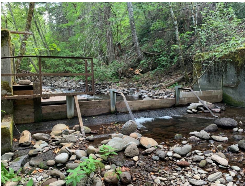
Figure 2. Tony Creek Passage Project flashboard dam diversion structure. Photo taken September 2022 looking upstream from right bank immediately downstream of structure. The flashboard support structure including concrete sill and abutments would be removed.

The Project proposes to improve the conditions at the diversion to maximize year-round fish passage for anadromous and resident fish species by modifying the structure and channel to accommodate fish passage. Passage would be created with stream-bed modification with a preferred naturalistic approach (e.g., constructed riffles, step pools, etc. ) that would not impact the intake pipe and would restore the historical habitat conditions in the area. The current diversion structure consists of a concrete sill that supports a flashboard dam infrastructure and is bounded by concrete abutments (Figure 2.) In addition, the Project would remove two relict bridge abutments within Tony Creek and a berm in the floodplain during floodplain regrading. The area of disturbance is approximately 2.5 acres.