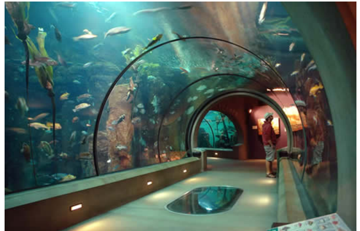
Passages of the Deep Exhibit

After some discussions on the Listserv and online research, Ecoxotic Aquarium lighting company was contacted to help. An evaluation of the project economics using lifecycle costs, where labor cost savings are included, clearly showed LED lighting to be the most cost effective choice in spite of high first costs. The company offered a good price and Central Lincoln PUD provided financial incentives.