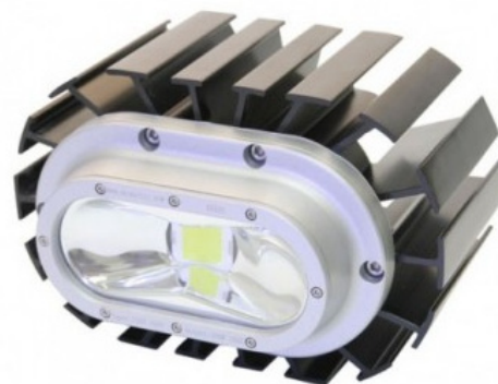
Cannon LED 100 Watt Elliptical LED Pendant