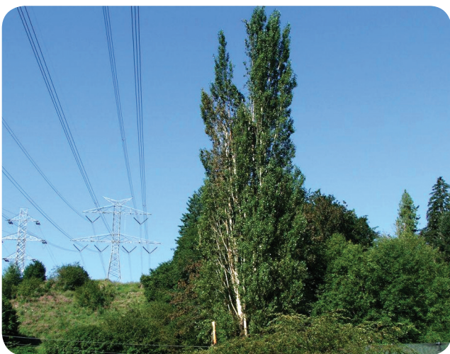
Trees that grow too close to high-voltage power lines are a hazard. In certain circumstances, electricity can jump or arc from the lines to the trees, which can cause power outages, fires and serious injuries to anyone near the trees.

As a result, the North American Electric Reliability Corporation, or NERC — a national regulatory body that oversees reliability of the U.S. power grids — issued new, more stringent, vegetation management standards for electric transmission lines. BPA and